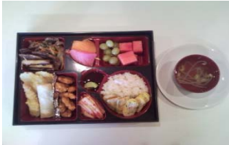
(KOREAN FOOD SET COMBO BOX )