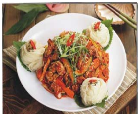
81. 골뱅이 무침 GOLBANGIMUCHIM R 150

(Crispy chicken nuggets fried with Hot pepper sauce )