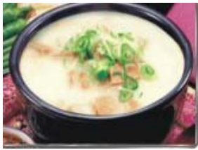
77. 설렁탕 SEOLLUNGTANG R 80