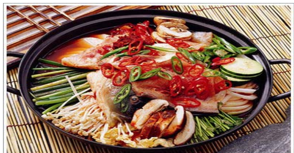
Hot pot with veg & fish