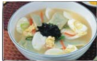
BEEF SOUP WITH RICECAKE AND DUMPLING