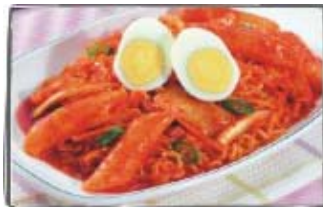
HOT SIMMERED RICE CAKE