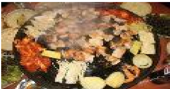
PORK BELLY STRIPS, ON BBQ PAN

95. 보쌈 (Bossam) Small R150 3~4 P Big R 300