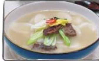
BEEF SOUP WITH RICECAKE