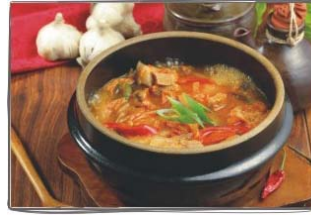
83. 김치 찌개 KIMCHIJJIGAE R 90

HOT SPICY KIMCHI STEW WITH TOFU AND PORK