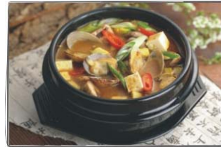
84. 된장찌개 DANJANGJJIGAE