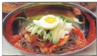
SPICY COLD NOODLE