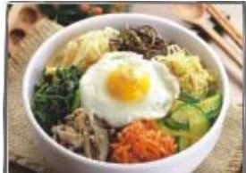
78. 비빔밥 BIBIMBAB R 80

HOT SPICY KIMCHI STEW WITH TOFU AND PORK