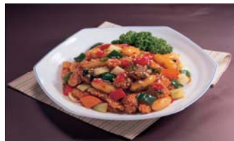
86. 간풍치킨 Ganpong chicken