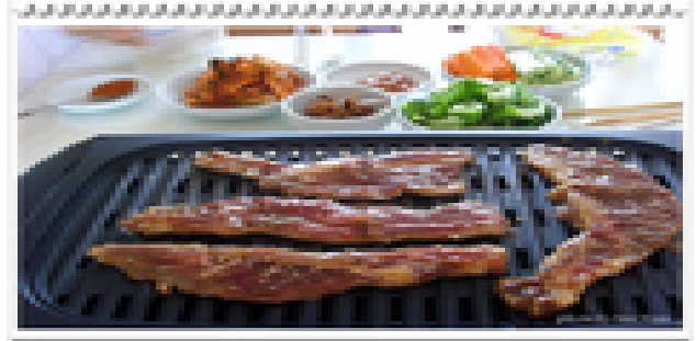
MARINATED SHORT RIBS ON BBQ PAN