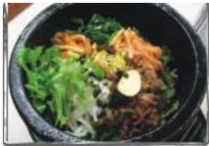
79. 돌솥비빔밥 DOLSOTBIBIMBAB R 90

SPICY RICE WITH ASSORTED VEGETABLES IN HOT STONE BOWL