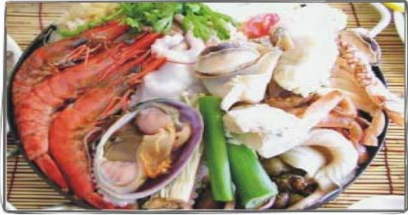
(Sea food Stew for 2P)