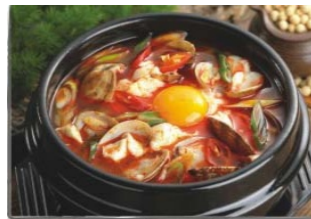
85. 순두부 찌개 SOONDUBUJJIGAE R 70

SPICY RICE WITH ASSORTED VEGETABLES IN HOT STONE BOWL