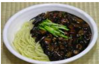
(Black bean Paste Sauce Noodles)