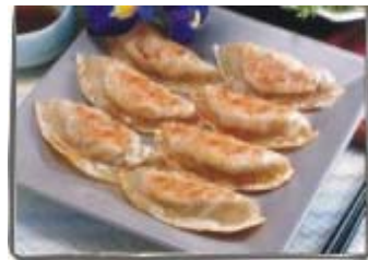
FRIED DUMPLING (BEEF/PORK/KIMCHI/VEG)