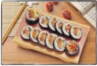
KOREAN STYLE MAKI