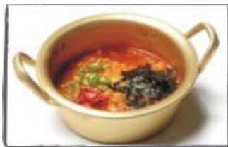
HOT SPICY KOREAN NOODLE