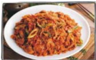
80. 제육볶음 JEYUKBOKKUM R 120

SPICY SOFT TOFU STEW WITH CLAM, PORK AND VEGETABLES