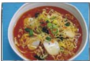
HOT SPICY KOREAN NOODLE WITH RICECAKE