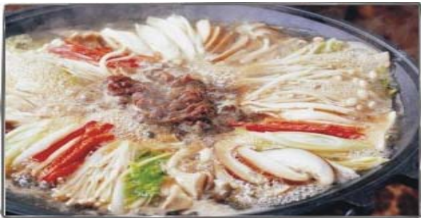
(Beef Stew For 2P)