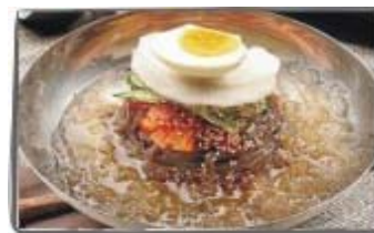
KOREAN COLD NOODLES