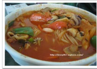
(Hot Spicy & seafood soup & Vegetable & noodles )