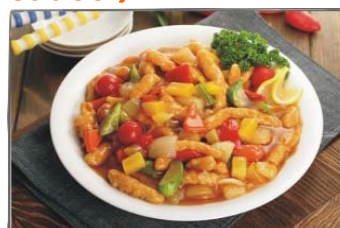
88. 탕수육 TANG SU YUK Big R 300 Small R 150

KOREAN PANCAKE WITH SEAFOOD AND ASSORTED VEGETABLES