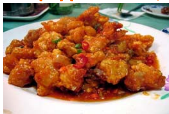
87. 간풍새우 Ganpong prawn