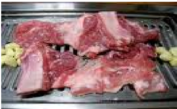
(Rolled beef ribs on bbq pan)