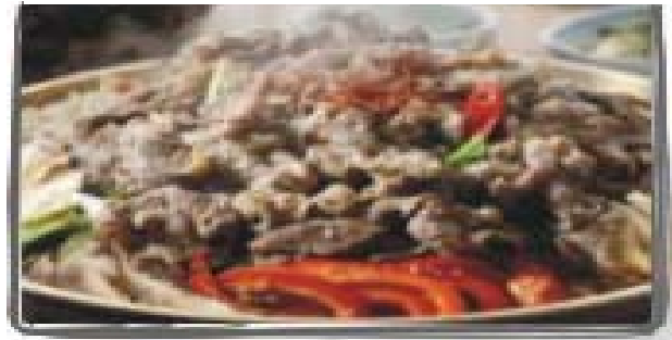
MARINATED BEEF WITH ASSORTED VEG